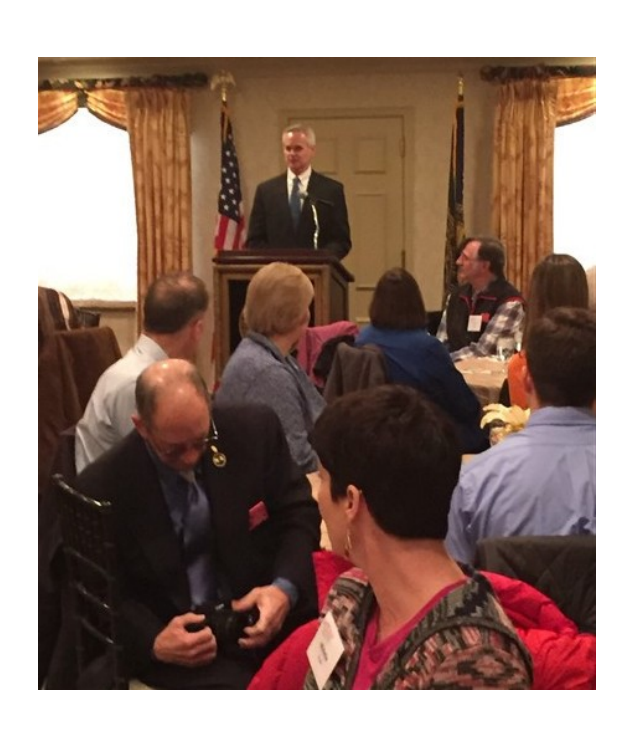
The Lt. Governor spoke at the governors mansion lunch. picture below.

Picture below, the award presentation and winner selection.