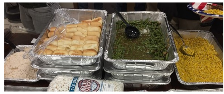
Chow Line of food provided by Texas Roadhouse (156th