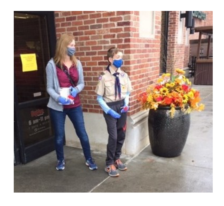
132nd and Dodge HyVee