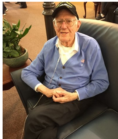
Picture left, 101 year old WW2 Navy Veteran. He was on a destroyer.