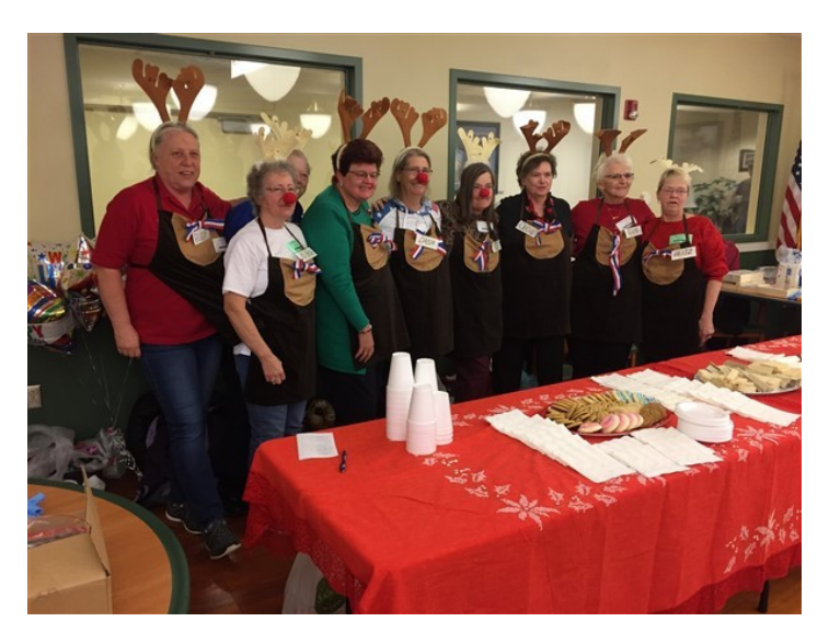
Eastern Nebraska Veterans Home XMAS Party 12-8-18