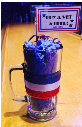
Point of purchase for our VFW Post 1581 and Texas Roadhouse program.